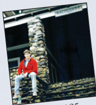
At camp in 1985

"My association with Camp Wachusett spans more than 40 years, beginning as a ten year old camper in 1976. Subsequently, I have risen through the ranks in nearly every position on staff, gaining the total camp experience. Now as owner and director, I am able to utilize my camp background to nurture a fun and safe environment for boys to explore our many outdoor activities